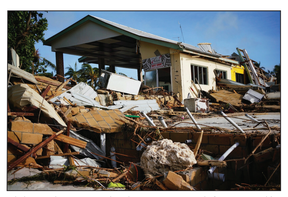
Vakaloa Beach Resort, Kanokupolu. Damage primarily from TC Harold Storm surge.